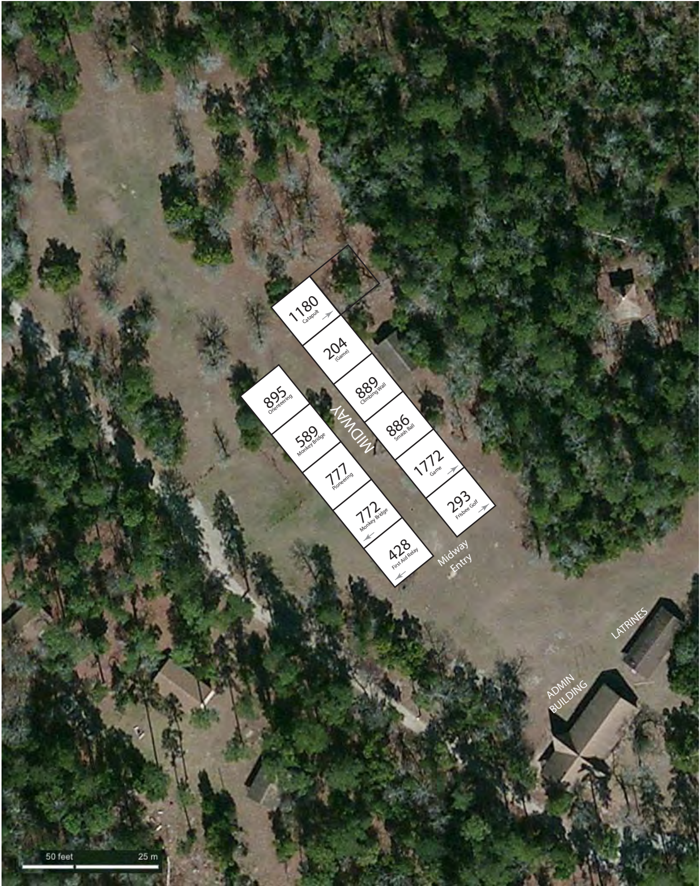
2011 Webelos Woods James West Field Layout Assignments